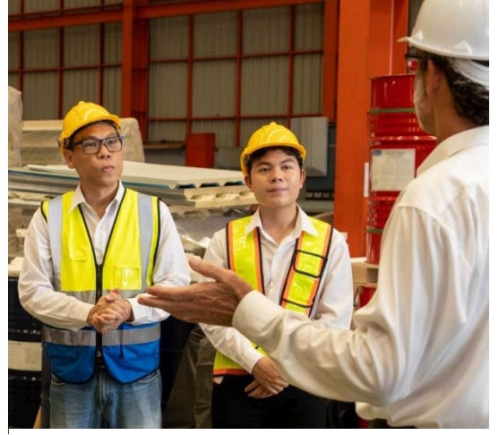
The image illustrates SGEs and OSHA personnel working together during an on-site assessment.

The Department of Defense (DoD) funds SGE training for up to three candidates at each DoD VPP Star site every year. The DoD also makes travel funds available for SGEs to participate in on-site VPP Star assessments. Contact your command and Service point-of-contact to request approval and funding if you are from a Star site and interested in becoming an SGE.