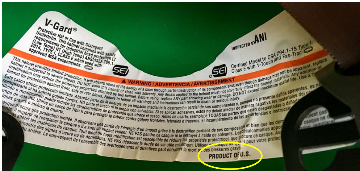
Figure 6 – V-Gard Label with PRODUCT OF U.S.